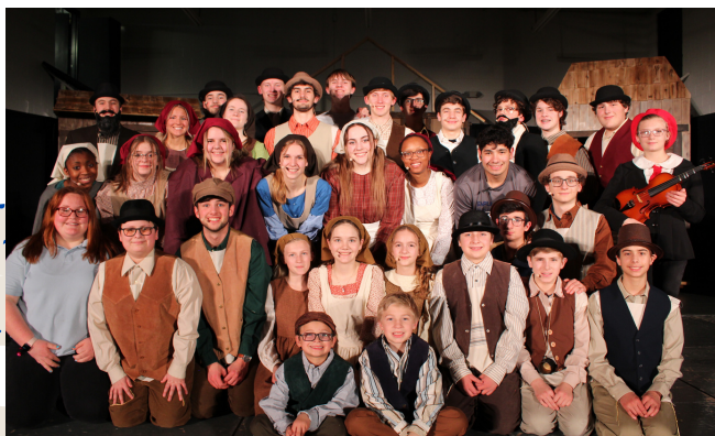
"Fiddler on the Roof" cast and crew