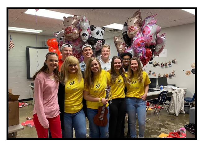
Seniors\ on\ Valentine \'s\ Day\

As you can imagine, we have been emotionally affected by the COVID-19 pandemic, which has caused senior year to end sooner than expected. We walked out of the halls of Temple for the last time and didn't even know it. Though, we do completely understand that the decision to close schools was obviously the best.