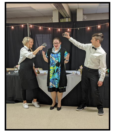
Café Murder