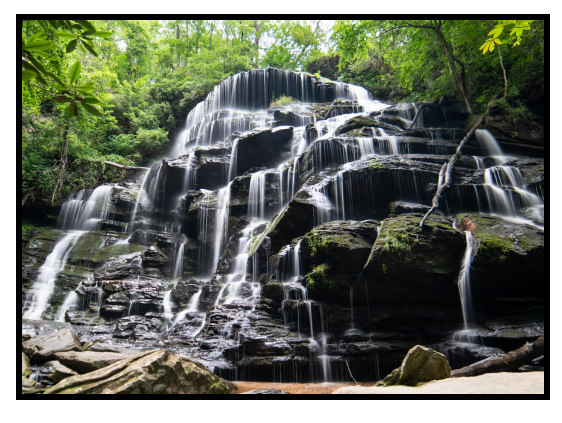
"Yellow Branch Falls"