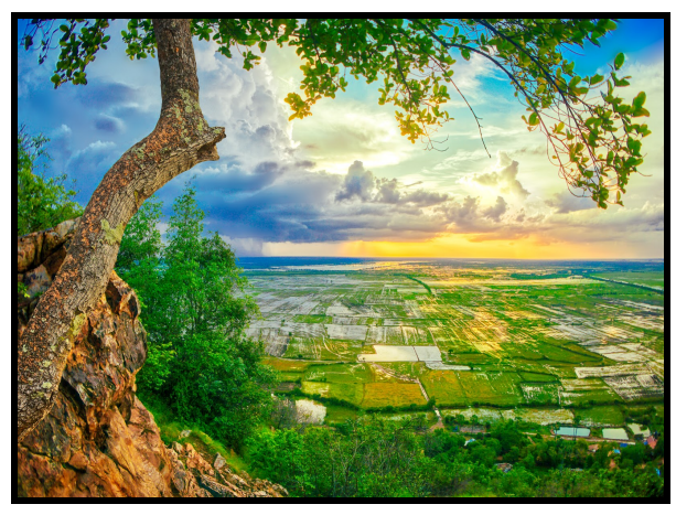
"Phnom Krom"